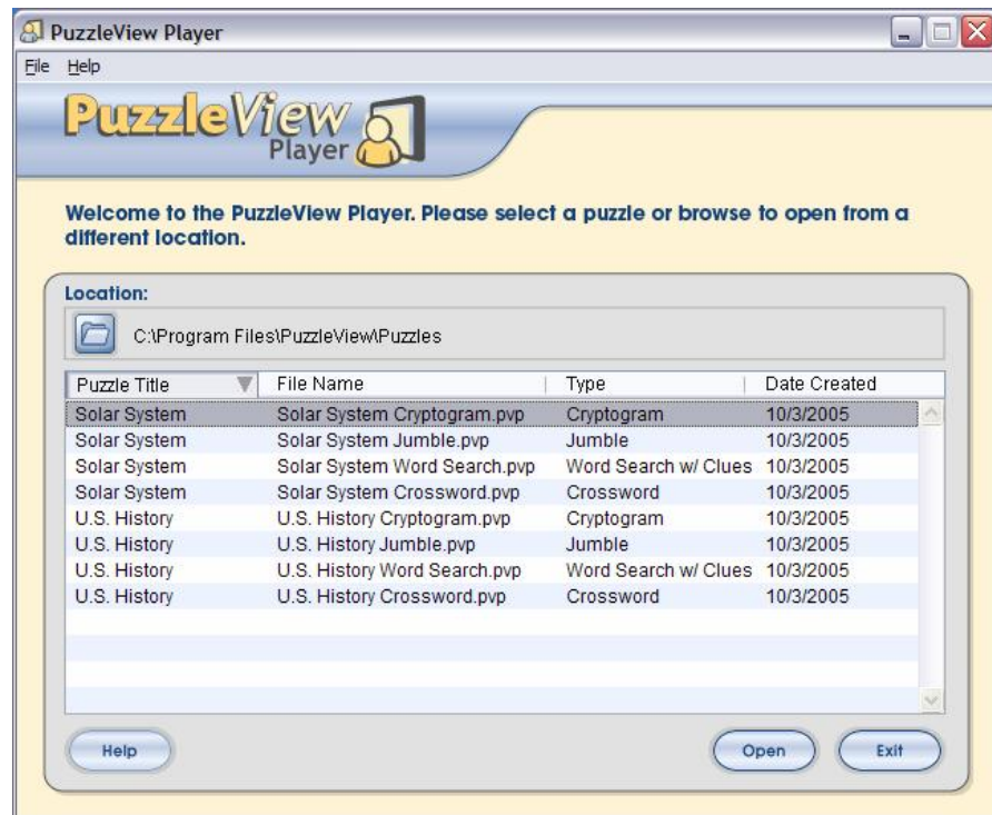
Figure 2 PuzzleView Player Main Menu